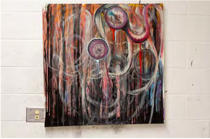
Figure 1: Untitled. Acrylic on canvas. 4ft x 4ft