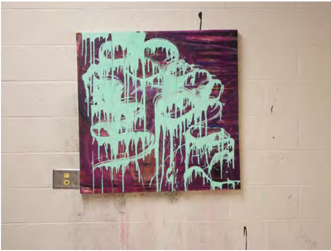
Figure 6: Untitled. Acrylic on canvas. 4ft x 4ft