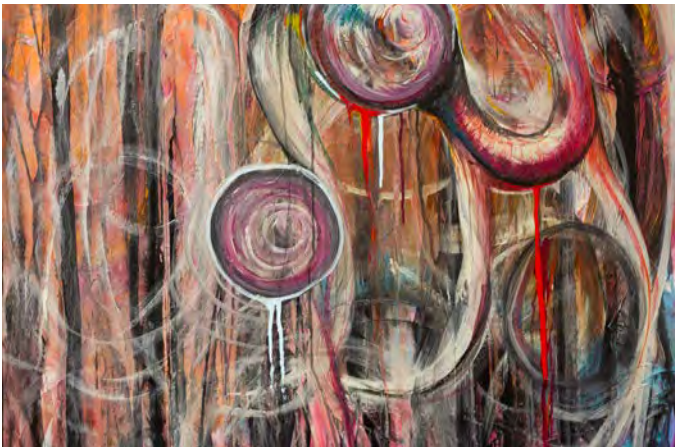
Figure 2: Untitled detail. Acrylic on canvas.

In this practice of showing up, I lean upon a secular understanding of the term ritual and consider the ritualization of art-making as an ongoing practice where one repeatedly embodies and embraces the participatory nature of making-thinking-doing but does not cling to established traditions and outcomes. In other words, the ritual and ritualization are formed in relation to one's lived experience. This perspective on ritual as dynamic and responsive, as Bickel (2020) points out, is part of emergent or nascent rituals that do not have previous attachments but might offer adaptable structures, or "structurings,"