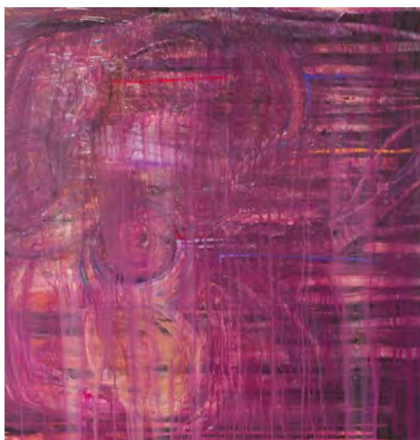
Figure 3: Untitled detail. Acrylic on canvas.